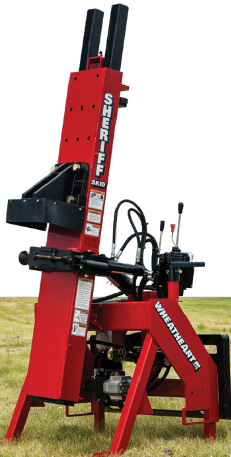
SHERIFF SKID STEER CENTER MAST SHOWN